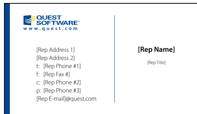
REP'S BUSINESS CARD